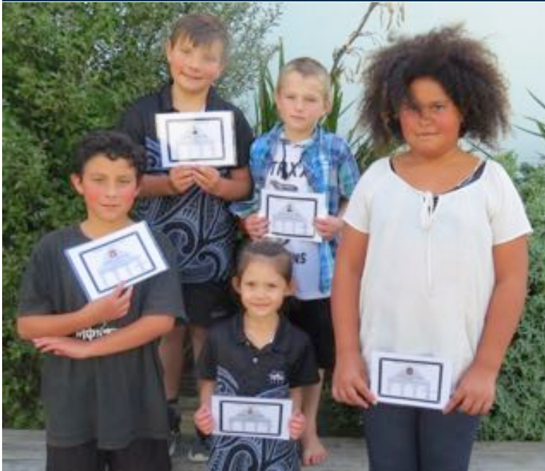
Absent from the photo: Darios Ruby - Parker